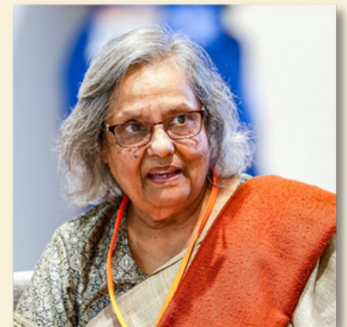
Honorable Ela Gandhi

The Honorable Ela Gandhi , Trustee of the Gandhi Development Trust, has continued her family's commitment to service by serving on the frontlines of the global interfaith movement. She sat on the Transitional Executive Committee in the South African Government, which was instrumental to the country's transition to a post-Apartheid state of normalcy. She went on to serve in South Africa's Parliament from 1994 to 2004, where she focused on motherhood support and welfare programmes. After leaving Parliament, she developed a 24-hour domestic violence support organisation and founded the Gandhi Development Trust, which she still chairs.