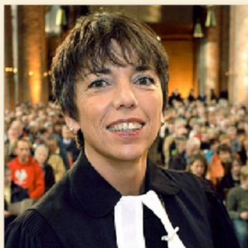
Bishop Dr. Margot Käsmann

Bishop Dr. Margot Käsmann served as a pastor and later Secretary General of the German Protestant Kirchentag. From 1999 to 2010, she served as state bishop of the Evangelical Lutheran Church of Hanover. In 2002, she received an honorary doctorate from the University of Hannover. From 2009 to 2010, she was chairwoman of the Council of the Evangelical Church in Germany (EKD). From August to December 2010, she was a visiting professor at Emory University in Atlanta (USA). In the period from January 2011 to March 2012, she taught and conducted research as a visiting professor for ecumenism and social ethics at the Ruhr-Universität