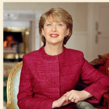
Dr. Mary McAleese

Dr. Mary McAleese was the 8th President of Ireland, the first person from Northern Ireland to hold that role. The theme of her Presidency was Building Bridges and throughout her fourteen years in office she worked to heal the fractured politico/sectarian relationships on the island of Ireland and between Ireland and Britain. During her Presidency she invited and hosted HM Queen Elizabeth II on the first state visit to the Irish Republic by a British monarch. She is chair of the Von Hugel Institute at St. Edmund's College, University of Cambridge and she chairs the Advisory Board of the University of Notre Dame's Ansari Institute for Global Engagement with Religion. She is the author of Children's Rights and Obligations in Canon Law; The christening contract (Brill 2019). In 2019 she was awarded the Alfons Auer Award in Ethics of the Catholic Faculty of Theology at the University of Tübingen. In 2020 she received the Woman of Courage Award of UNANIMA International at a ceremony in the United Nations HQ, New York.