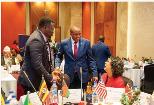
The importance of interreligious dialogue in an increasingly fragmented world cannot be overstated.

Reimagining multilateralism in the current global context requires renewed attention to inclusive participation, ethical leadership, and the strengthening of trust between institutions and communities. As international institutions confront increasingly complex and interconnected challenges, there is a growing need for more inclusive forms of cooperation – anchored in religious multilateralism and inspired by a shared sacred worldview – that bridge global policymaking with local realities and community-based approaches to peace, resilience, and sustainable development.