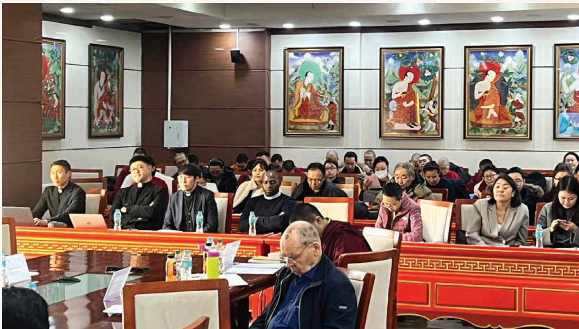
Targeted support is helping to strengthen Interreligious Councils across the Religions for Peace movement—building the infrastructure for dialogue. In this photo, diverse religious leaders convened in Ulaanbaatar, Mongolia, to reflect on improving interreligious collaboration.