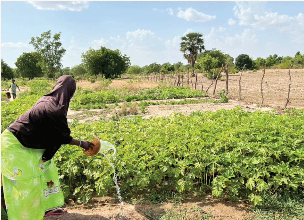
A woman waters a tree nursery in Mali, using water from a solar-powered borehole. Projects like this, implemented by the African Council of Religious Leaders- Religions for Peace , are helping communities mitigate the impacts of climate change.